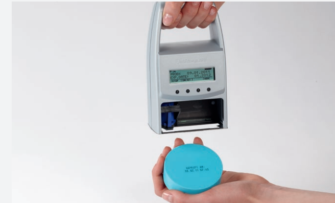
Prints easily, quickly and quietly on all even and uneven surfaces.